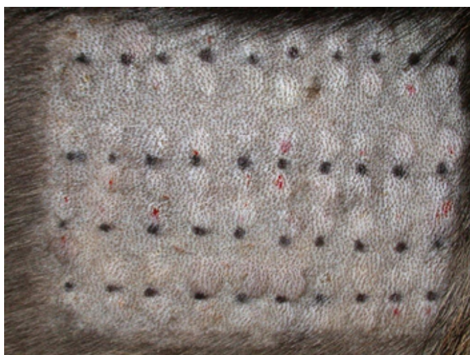
Intradermal allergy testing can be more difficult to interpret in a darkly coated dog...